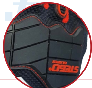
SHELL-GRD® on back