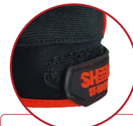
Hook & loop strap