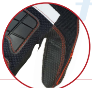
Reinforced Thumb saddle