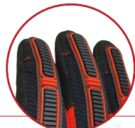
SHELL-GRD® on fingers