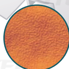
HI-VIZ LATEX COATED